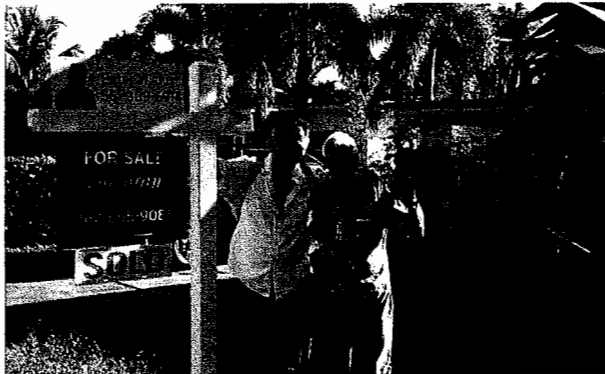
SOLD - 626 N. LAKESIDE