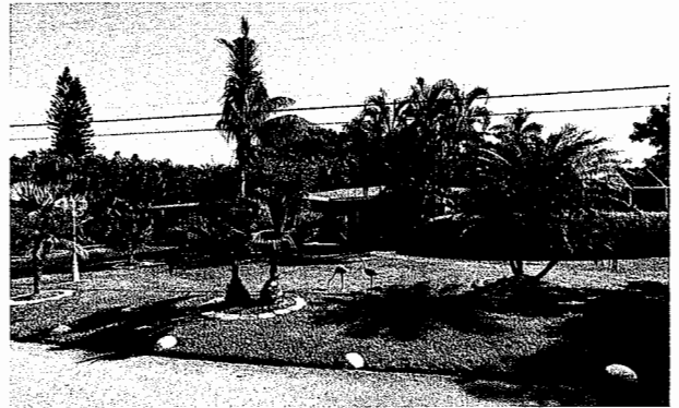
SOLD - 720 S. ATLANTIC