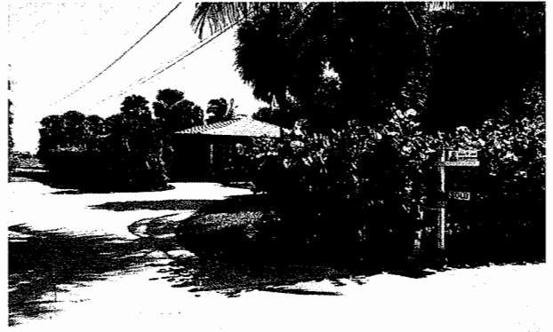
SOLD - 1002 S. LAKESIDE

... THEY WERE ALL RECENTLY SOLD BY PETER JUST!