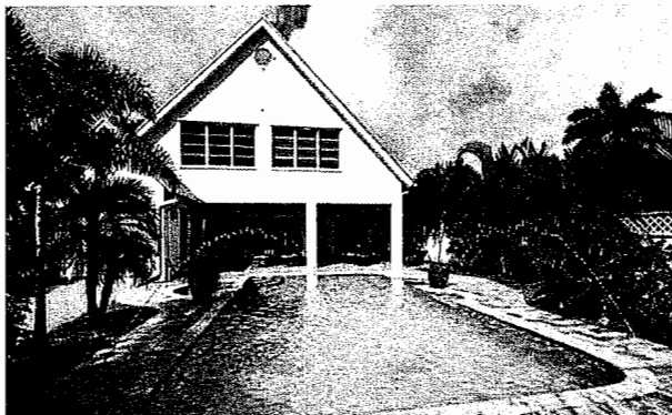
SOLD - 1118 N. LAKESIDE