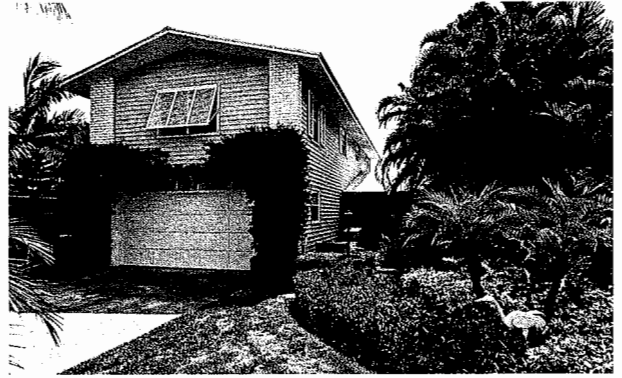
SOLD - 314 N. LAKESIDE